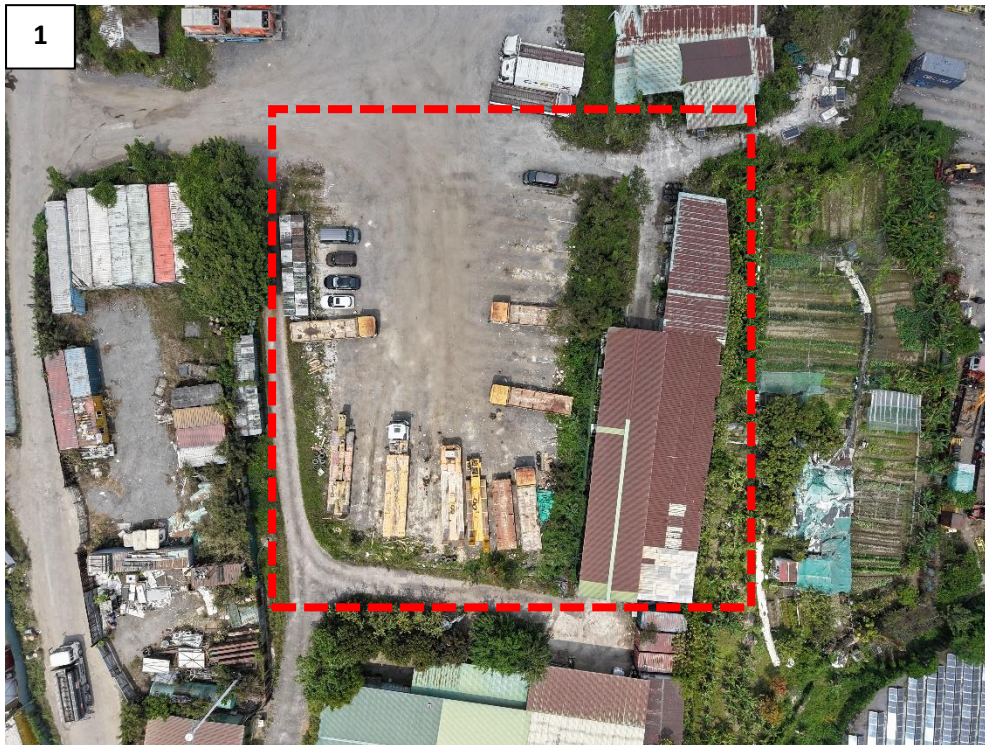
Source: Aerial Photos taken on 19.03.2026