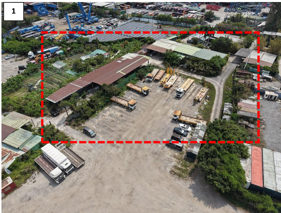
Source: Aerial Photos taken on 19.03.2026